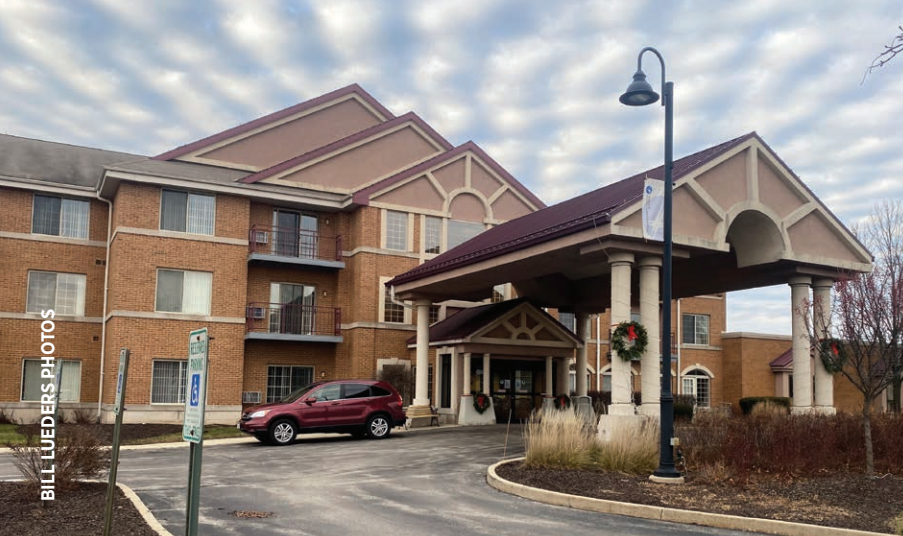
LEFT: The Regency, in New Berlin, Wisconsin.